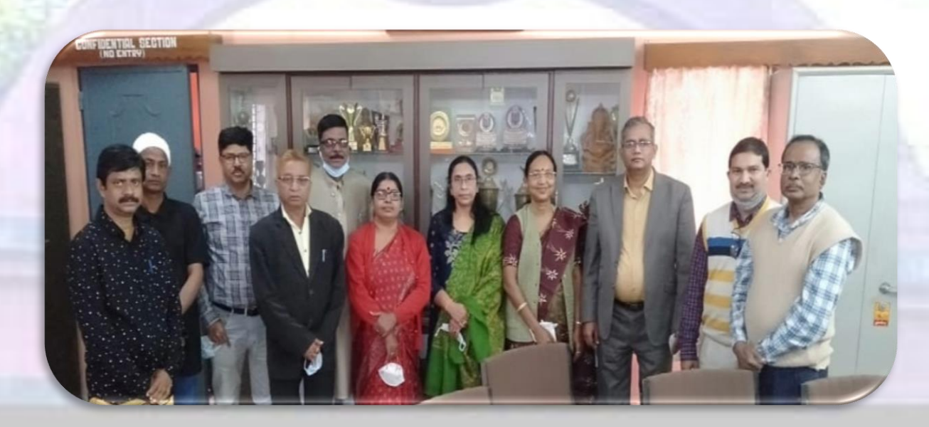
Members of the Governing Body